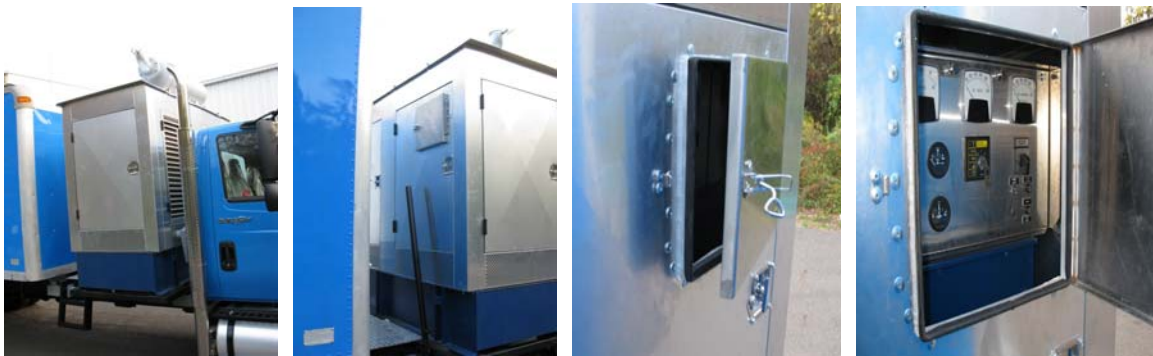
Mounted Generator Set with added easy start Access Door