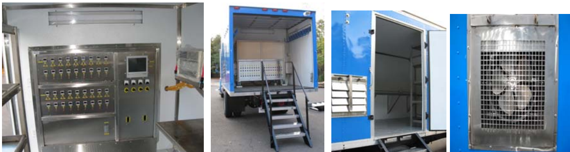
Finished Truck on the Inside, and the Fan shrouds and locations