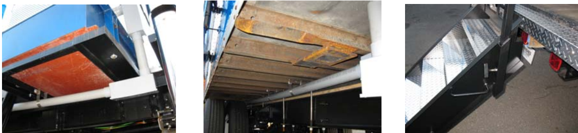
Schedule 80 Underground Plastic Pipe, Quick screw hand rail holders